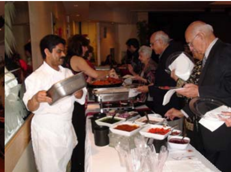
The cooks and helpers serving the dinner!