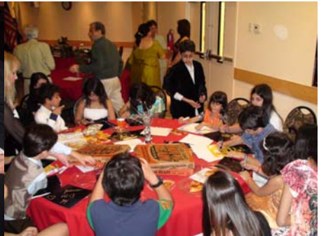
And the Z-Club having Pizzas with crayons!