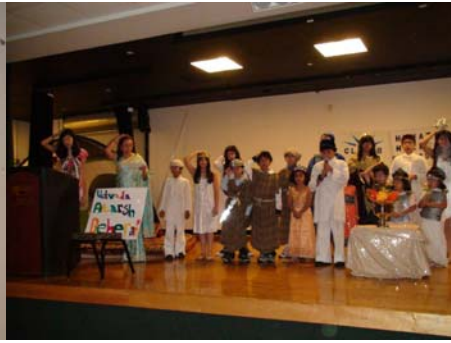
Another stellar performance by the Z-Club!