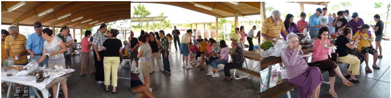
Appetizers for the early birds!