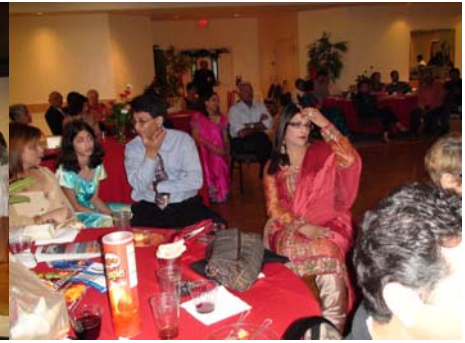
The appreciative audience watching Z-Club!