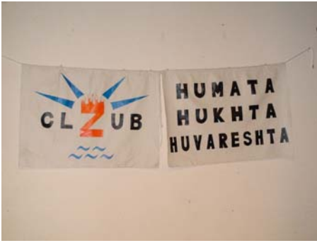
Banners of Z-Club and its Motto!