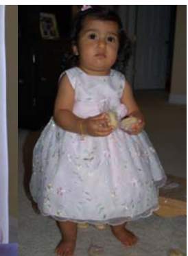
Step on those Laaroos!