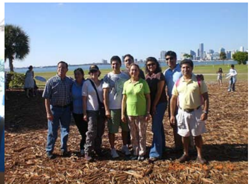
Z Club Parents and Supporters