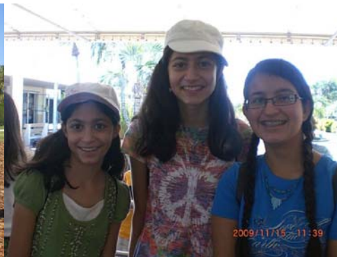
Z Club Mentors